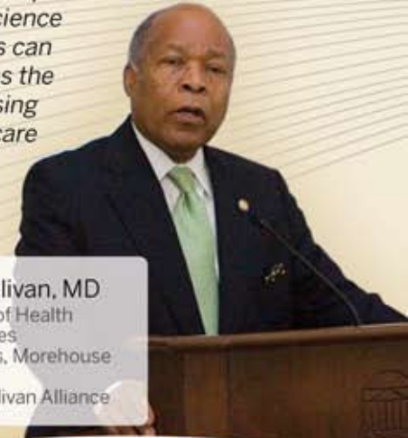
Dr. Louis W. Sullivan, MD Former Secretary of Health and Human Services President Emeritus, Morehouse Medical School Chairman, The Sullivan Alliance

“This model partnership between academic health science centers and HBCUs can be replicated across the nation to find “missing persons” in healthcare and research professions.”